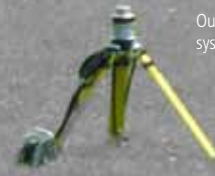
Outdoor autonomous vehicle tracking for guidance system validation

iSpace systems enable 6DOF tracking & trajectory logging at speeds up to 10m/s with unparalleled accuracy