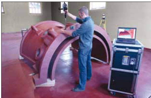
Inspect or scan large and complex assemblies faster than ever before